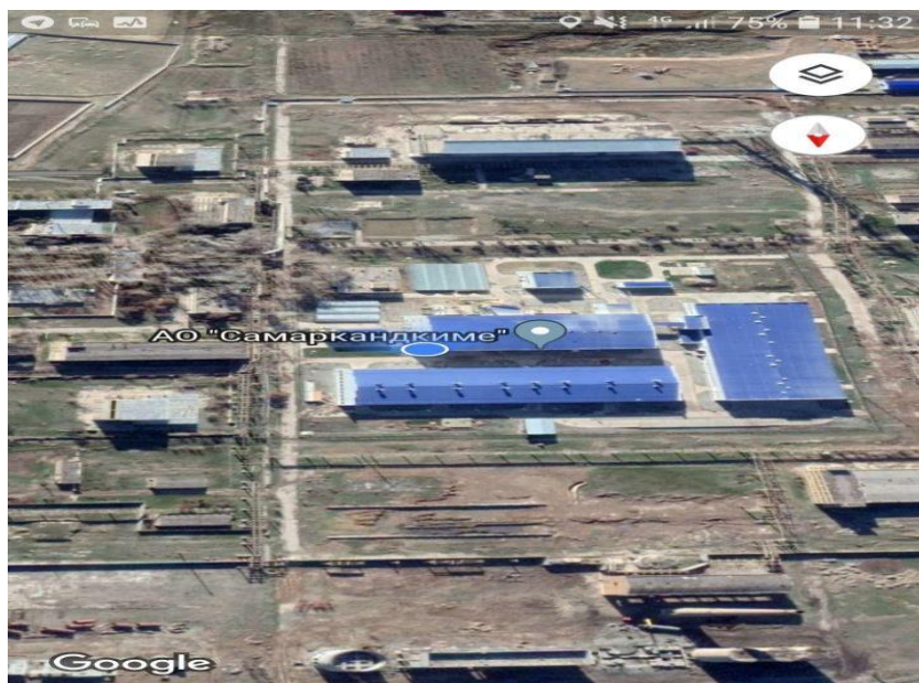
Figure-2. The schema location for the production of mineral fertilizer nitrogen-phosphorus-potassium (NPK) JSC "Samarkandkimyo»

Production of asbestos-containing slate. The preparation of corrugated asbestos-cement sheets is carried out in the following stages. Storage and standardization of asbestos; hydraulic softening of asbestos; humidification and improvement; preparation of suspension asbestos-cement mixture; preparation of reserve, delivery of asbestos-cement mixture; transform; from form to list; undulating formation and calibration of the list; loading on a conveyor cart for distribution and solidification of the sheet; primary fastening; wetting, final curing.