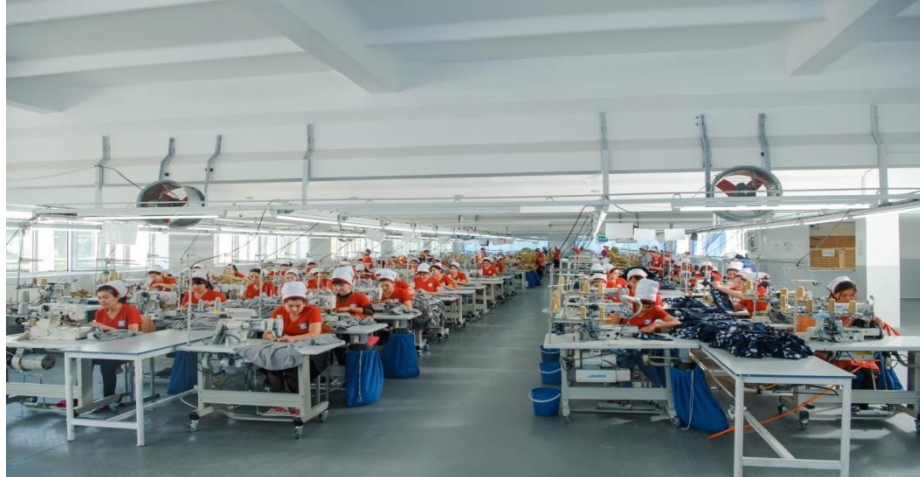
Figure 2. "Chust textile" enterprise is a workshop for sewing knitted products.

This indicator is expected to reach 14.0 million dollars in 2022 (Figure 1). "Chust textile" products are from foreign countries: Russia, Italy, Cyprus, Belarus, Georgia, Greece, USA, Ukraine, France, Canada, Korea, Czech Republic; It is exported to neighboring countries: Kazakhstan, Tajikistan, Kyrgyzstan.