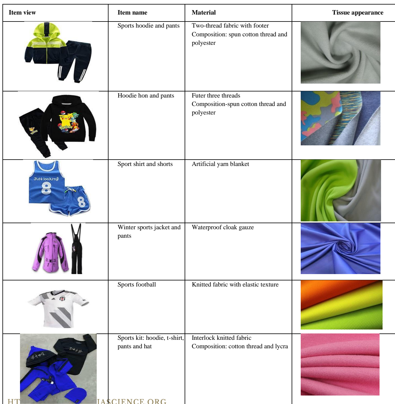
Assortments of sports clothes Table-1

Futer three-thread Composition - spun cotton thread and polyester